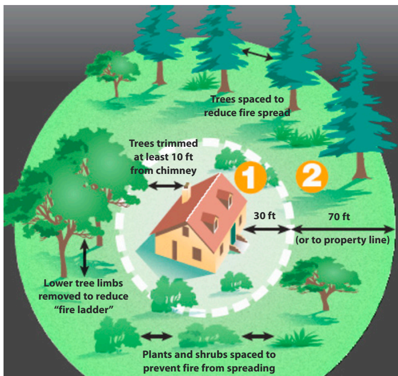
Figure 3. Keep branches trimmed at least 10 feet from your roof and eliminate combustible plants or material under the eaves and next to the house siding and vents.

the house or to your property line. (See the metric conversion table at the end of this publication.) Greater defense zone widths are necessary when your home is on a steep slope or in a windswept exposure. Specific recommendations for each zone are described below and pertain to the State Responsibility Area (SRA) protected by CAL FIRE. Local Responsibility Areas that are protected by fire departments may have different requirements.