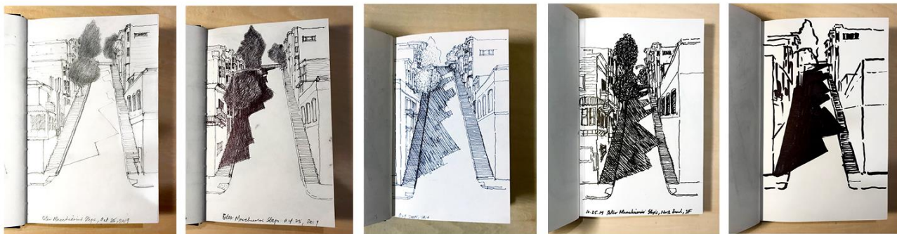
Figure 6. “Peter Macchiarini Steps”. San Francisco. October 25, 2019. Graphite pencil, ballpoint pen, and felt-tip pen on paper. Drawings by Tanu Sankalia.

The sketches and drawings in this essay are my notes of the streets. There are three panels of perspective sketches of each street in gray tone, accompanied by a section drawing of each in color (Fig 7, 8, 9). Sketching involved another, different kind of urban ethnography – of being in the field, hanging out, getting to know the streets as subjects in their own right, asserting their strength as they climb up Telegraph Hill. I observed residents go in and out of buildings, delivery trucks yanking on their handbrakes, rideshares dropping off people; and, come evening, the odd smattering of tourists who would incredulously climb up the steep streets with their cameras to take in the grand views of downtown. Evening was also the time when the residents of Telegraph Hill were returning home from work, panting up the steep incline and occasionally