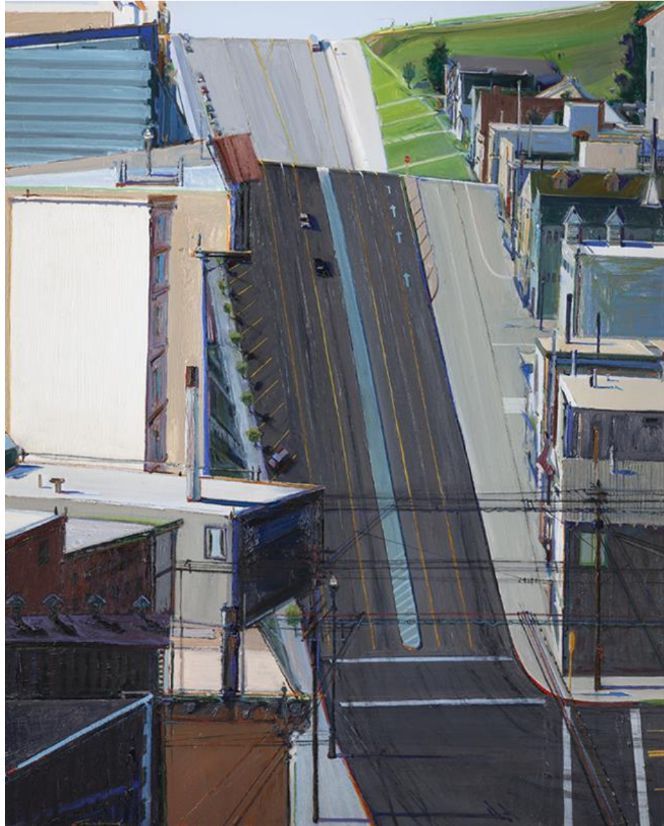
Figure 1. Wayne Thiebaud, "18th Street Downgrade", 1978, Oil on Canvas, SFO Museum. https://www.sfomuseum.org/public-art/public-collection/18th-street-downgrade . Accessed, April 17, 2023.