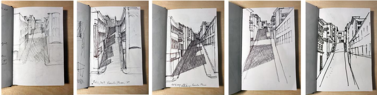
Figure 5. “Romolo Place” San Francisco, October 4 & 11, 2019. Graphite pencil, ballpoint pen, and felt-tip pen on paper. Drawings by Tanu Sankalia.