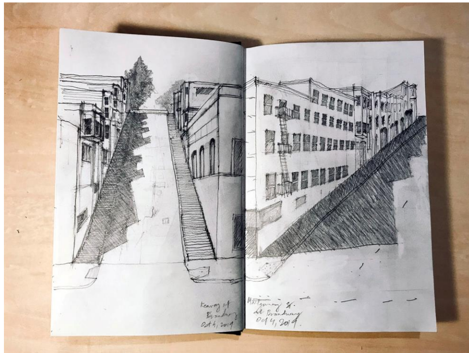
Figure 4. “Peter Macchiarini Steps and Montgomery Street”. San Francisco. October 4, 2019. Graphite pencil on paper. Drawings by Tanu Sankalia.

unable to achieve an accurate sense of perspective at first, I began drawing sections of the street to get a clear sense of height, depth, and scale. Later, I traced over these sections, spread across the spine of the sketchbook, in freehand, depicting the facades of buildings on both sides of the street, as another way to emphasize the sheer verticality. 23 Gradually, as my awareness of the perspective grew, I was able to draw more accurately. I focused on capturing the street through quick sketching, much like the camera might work, frame after frame. But another reason for repeated drawing was also because I wanted to get the perspective right, capture correctly the details of buildings, roof profiles and bay windows. I also wanted to try different media—sketching with pencil, ballpoint pen, and felt tip pens—and achieve varied line quality to depict different aspects of light and shade. The perspective sketches were done on the street, and by no means involved taking photographs and tracing over them in the comfort of the studio (Figs. 4, 5, 6).