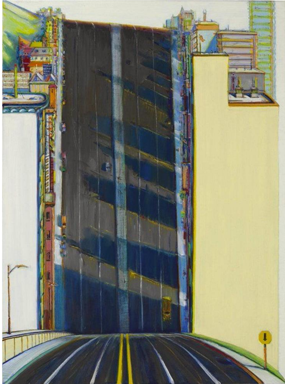
Figure 2. Wayne Theibaud, "City Downgrade", 2001, Oil on Canvas. From Sotheby's. https://www.sothebys.com/en/buy/auction/2021/american-visionary-the-collection-of-mrs-john-l-marion/city-downgrade . Accessed, April 17, 2023.