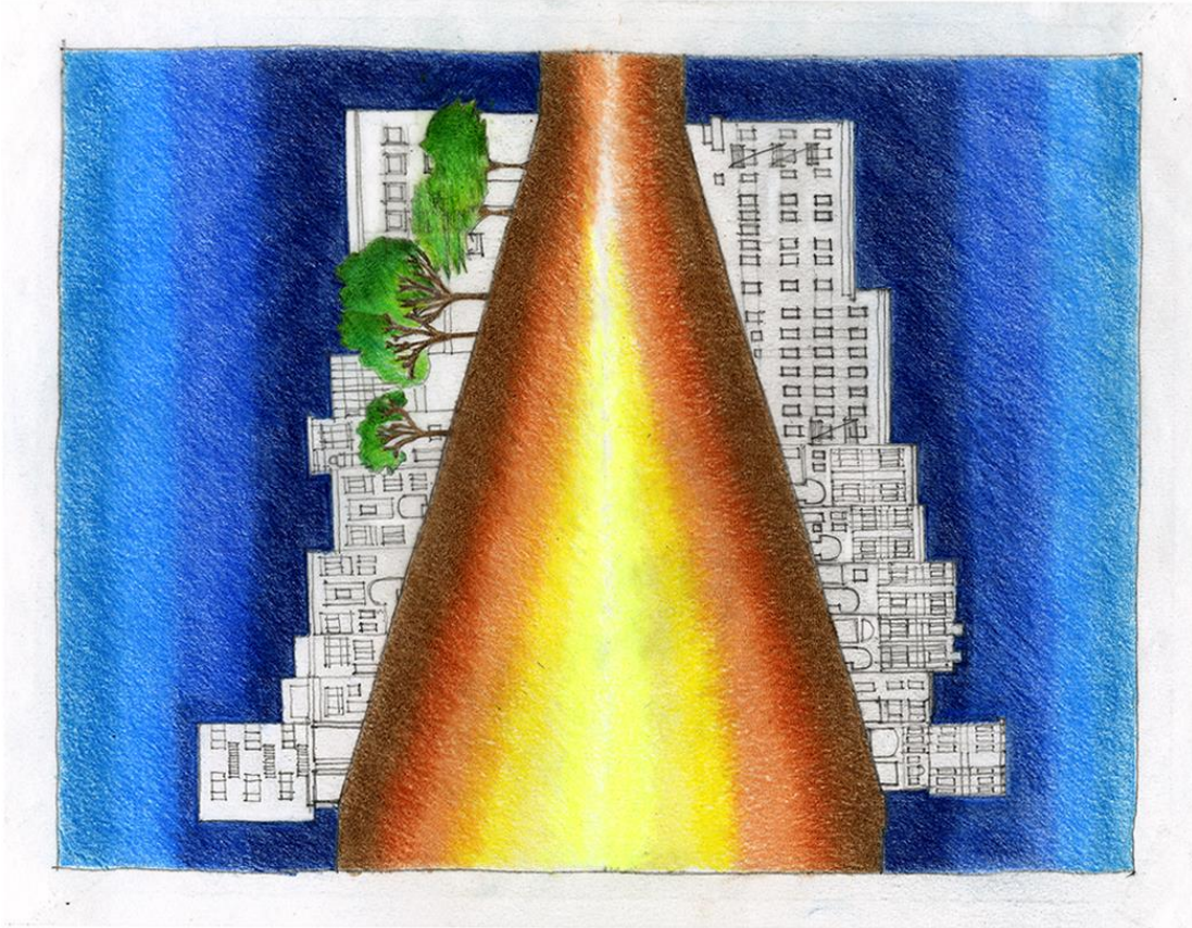
Figure 8. "Section drawing, Montgomery Street". San Francisco. June-July 2020. Graphite pencil, and color pencil on vellum. 9 x 12 inches. Drawing by Tanu Sankalia.