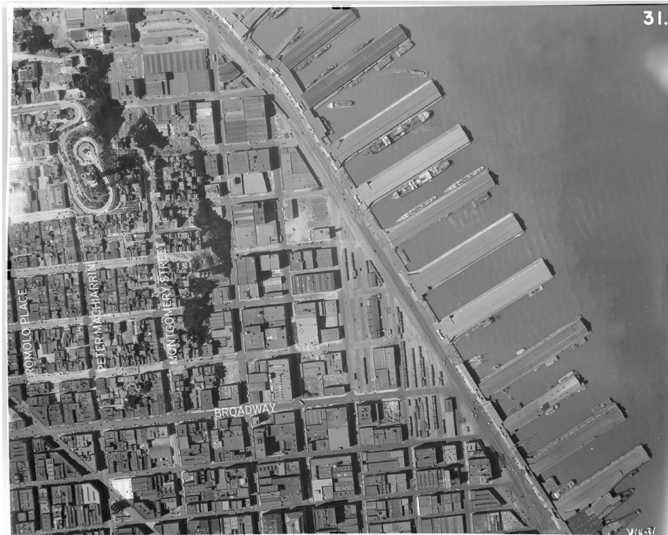
Figure 3. Telegraph Hill with Coit Tower, Broadway running east-west (left-right), and the steep streets, Romolo Place, Peter Machiarini Steps and Montgomery Street, going up the hill. Image: Harrison Ryker, 1948 (Courtesy David Rumsey Map Collection).

In search of my own point of view, I picked up my sketchbook and pouch of pencils and pens and headed for Telegraph Hill. After surveying the area, traversing the different sides of the hill, up to Coit Tower and down Filbert Steps, I settled on three streets to study and draw: Romolo Place, Peter Machiarini Steps and Montgomery Street. Kearny and Montgomery Streets originate in downtown, from Market Street, cut north and bisect this short stretch of Broadway, marching up Telegraph Hill towards Coit Tower (Fig 3). Kearny Street becomes so steep at this point that the sidewalk has been built into steps, and therefore this section of the street was called the Kearny Steps. In 2001, the street was named after Peter Machiarini (1909 – 2001), an Italian-American modernist sculptor and jewelry designer who owned a studio on nearby Grant Street. 22 In a democracy such as ours, it was reassuring to find that we do after all recognize our streets by naming them after the denizens of the city.