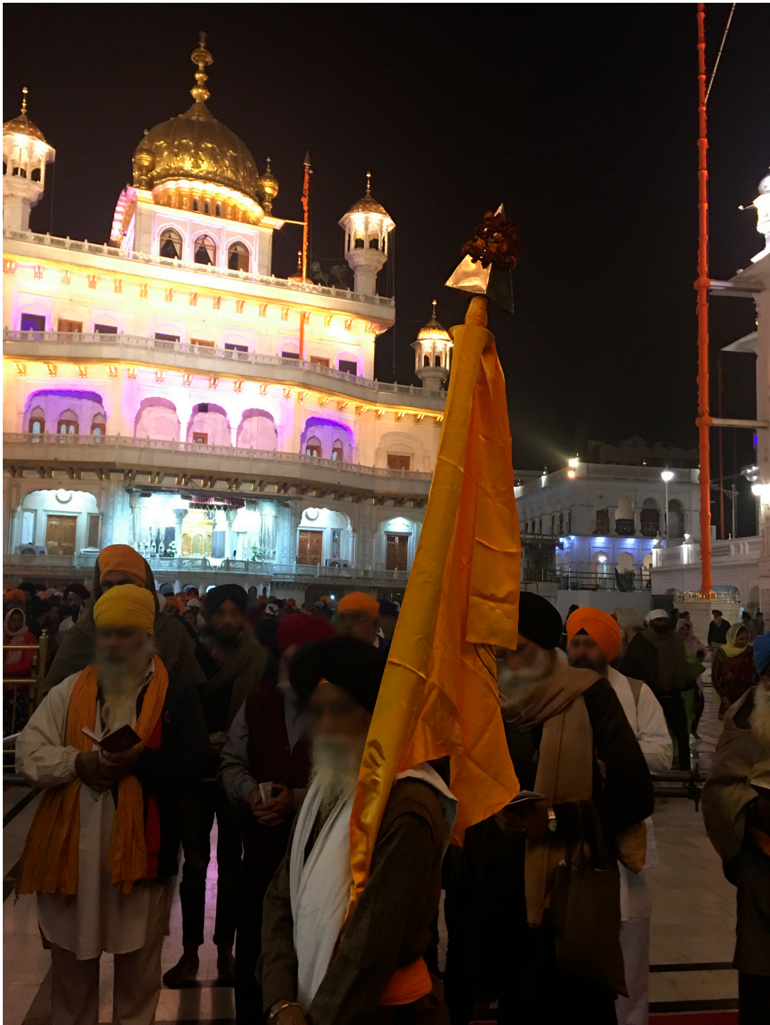
Figure 2. A processional Chaunkī Sāhib in front of the Akal Takhat in Amritsar early in the morning of 24 November 2019. The author personally attended this performance event.