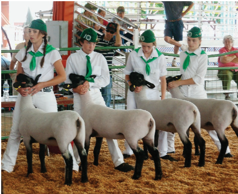
Participants in the Shasta County 4-H program exhibit their project lambs at the Shasta District Fair.

We used data from 4-H record books to evaluate the 4-H programs in Shasta and Trinity counties. These books are completed annually by youth participants throughout California to describe and quantify their experiences in the program and reflect on their involvement in citizenship, leadership and life-skills activities. Quantitative and qualitative data from the reports was coded according to the Targeting Life Skills model developed at Iowa State University. Most club participants reported life-skill activities in each component of the model (Head, Hands, Heart and Health), in accordance with established 4-H goals. This method is applicable to other counties wishing to perform 4-H program evaluations using club participants' record books.