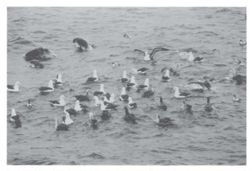
Fig. 2. Flock involving Antarctic fur seals, Black-browed Albatross, giant-petrels, Cape Petrels and a Grayheaded Albatross. To the upper right is a Black-browed Albatross with its wings open, the posture often seen before a dive. Also on the right a Black-browed Albatross is chasing a giant-petrel. The spatial arrangement evident here is typical, with the fur seals at the front, followed by the Black-browed Albatross, and with the giant-petrels at the rear. Note also the "gawky look" or puffed cheeks on the Black-browed Albatross.