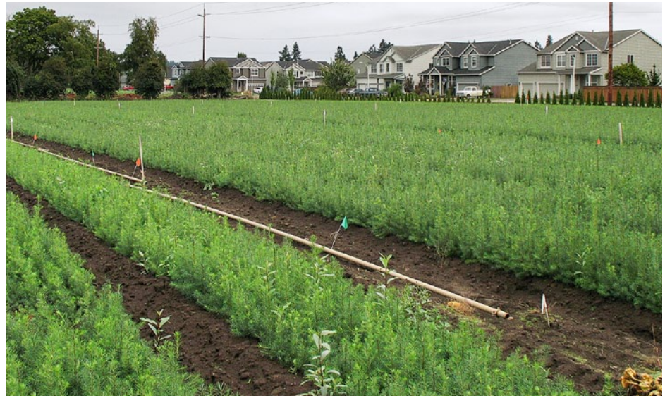
Suburbs have encroached onto land adjacent to some forest seedling nurseries, which significantly restricts growers' use of fumigants.

To meet demand for seedlings, nurseries in the western states of California, Idaho, Montana, Oregon and Washington produced approximately 200 million