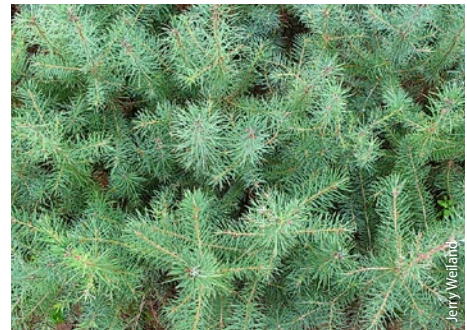
Closeup of nonfumigated plot shows disease and weed pressure, top; fumigated plot shows healthy Douglas-fir seedlings, above.

MB:Pic) has been part of the operational fumigant standard for decades in most industrial forest nurseries. Chloropicrin is an effective soil disease control agent when used alone at 100 to 300 pounds per acre. However, broad-spectrum weed control is generally lacking.