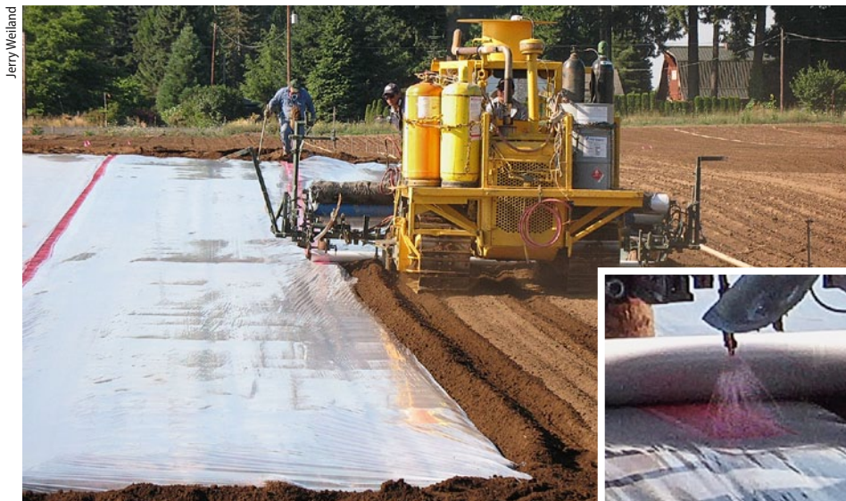
Application of virtually impermeable film (VIF) over a reduced rate of iodomethane plus chloropicrin. Glue (red strips) is released from the spray nozzle before the film unrolls (insert).

Chloropicrin. Chloropicrin formulated with methyl bromide (98:2, 67:33 or 50:50