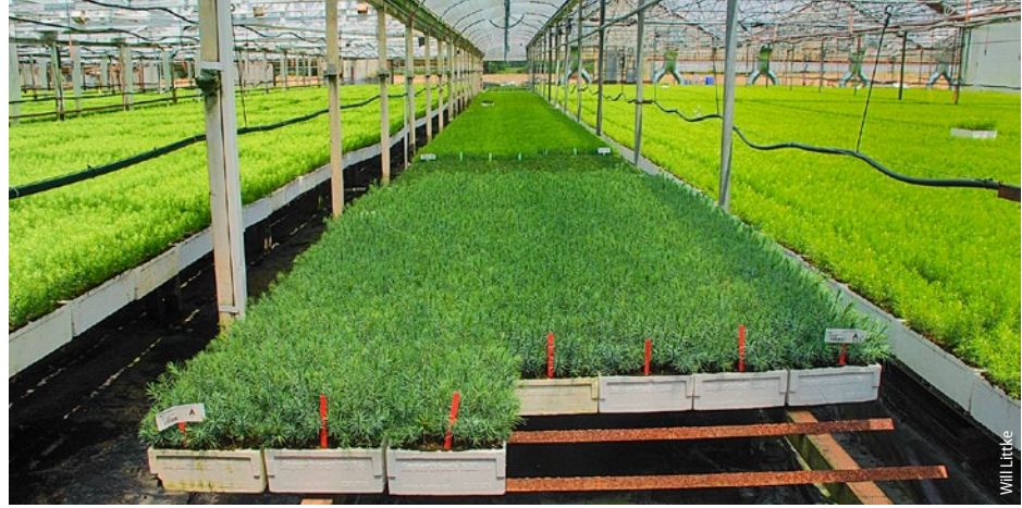
As the forest nursery industry transitions away from methyl bromide, combining nonfumigant methods such as container production with fumigants will provide the best strategy for disease control. Above, container production in the Weyerhaeuser Rochester Greenhouse, Rochester, WA.

Tools have also been developed that distinguish between pathogenic and non-pathogenic isolates. Stewart et al. (2006),