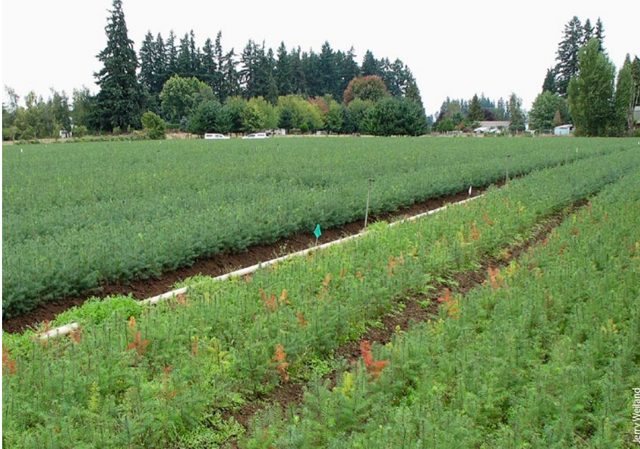
Nonfumigated plot shows disease and weed pressure, right foreground. Fumigated plot is in background.