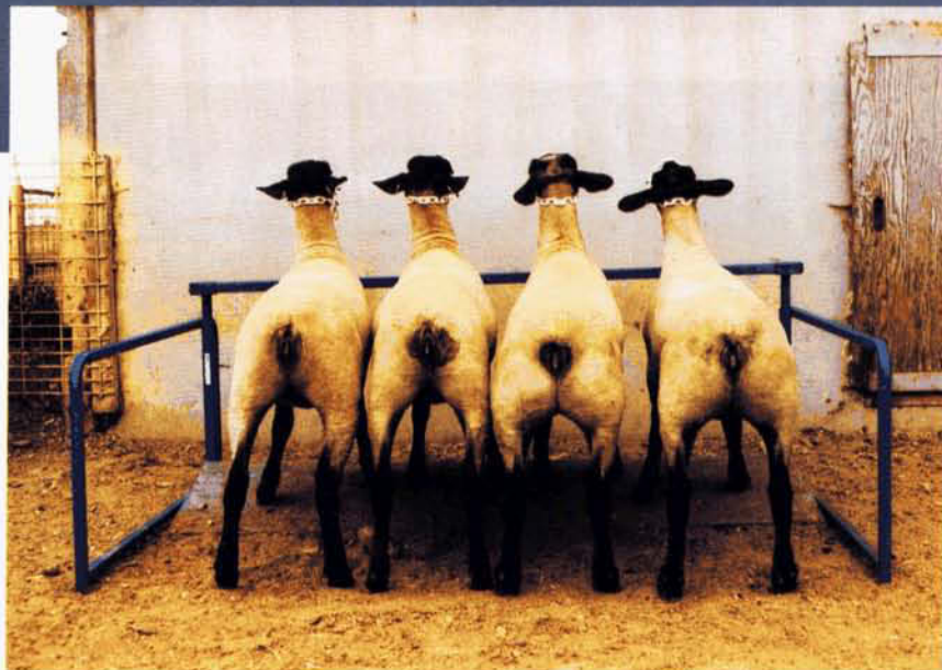
Callipyge lambs (two on right) have enlarged muscles in the hindquarters, compared with normal lambs (two on left). However, their meat is tougher than normal lamb.

In 1983, a sheep breeder in Oklahoma noticed a ram with exceptional muscling, especially in the hindquarters. This ram, Solid Gold, was mated to normal ewes, and the condition was passed on to their offspring. Eventually the extra muscling was found to be due to a spontaneous mutation, a natural change in the animal's genetic code. Because the muscle hypertrophy (enlargement) is most pronounced in the hindquarters, the condition was named callipyge , a Greek word meaning "beautiful buttocks." Needless to say, sheep breeders were immediately interested in the meat production potential of lambs carrying the callipyge gene.