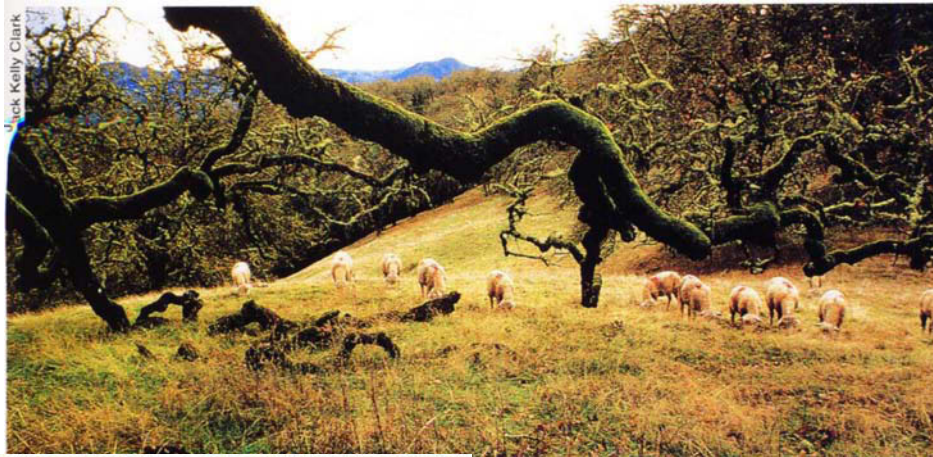
Sheep research at the UC Hopland Research and Extension Center has focused on breeding to improve performance, and on the sexual behavior of rams. Sheep graze on a pasture at the center in southern Mendocino County.

Scientists working at the UC Hopland Research and Extension Center (HREC) have made important contributions to the sheep industry in breeding and genetics, and in the understanding of animal behavior. A long-term experiment involving HREC was initiated in 1960 to evaluate the effects of selection environment on sheep performance under range conditions. Selection of the UC Davis flock, representing the favorable conditions typical of purebred flocks where most breeding rams are raised, resulted in more within-flock improvement in weaning weight than selection under range conditions at Hopland. However, when the UC Davis- and Hopland-selected lines were compared under range conditions at HREC, the two were equal in weaning weight, and the Hopland line was superior in reproduction and total productivity. We concluded that selection should take place in the environment of use. In the late 1970s, investigations were initiated to develop cost-efficient techniques for fostering lambs to unrelated ewes; an effective new method was developed using stockinette jackets and neatsfoot oil to transfer odors. Likewise, research on sexual behavior has resulted in several relatively simple behavioral tests that can be used to determine the performance of rams.