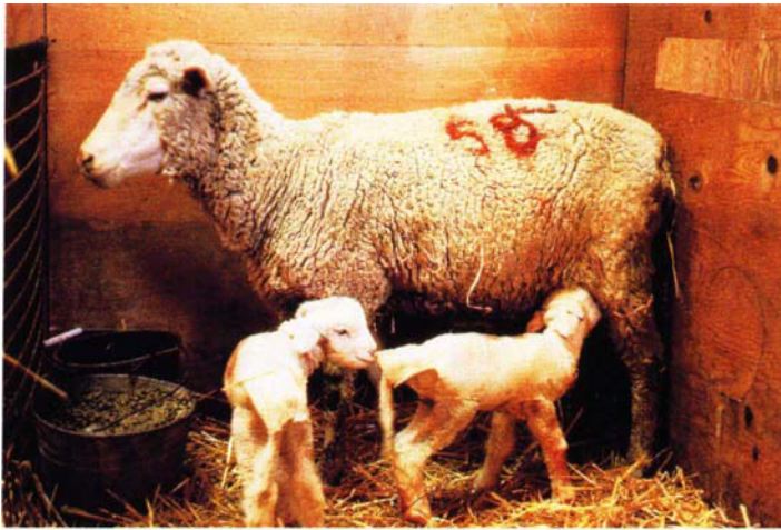
A ewe that has given birth to a single lamb adopts a second alien lamb using the odor-transfer technique, in which cloth stockinette jackets are fitted onto lambs at birth and then exchanged at the time of fostering.