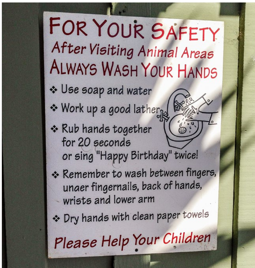
FIG. 1. Example of handwashing signage at the California county fairs included in this study.

We conducted this observational study at four county fairs across the state of California during the summer months (July, August, September) of 2015. The fairs were located within two geographic regions of California, the Central Valley (two fairs) and the Central Coast (two fairs). We observed fair visitors specifically for handwashing practice at barns containing livestock. Barn setups varied; some barns contained exhibition animals, others contained animals in petting zoos. However, all observation sites consisted of pens that kept livestock separated from visitors, walkways for visitor traffic and an entrance and exit. Handwashing (sink or alcohol-based hand sanitizer) stations were present at the exits of all barns where observations were made, and handwashing signage was present in some, but not all, barns.