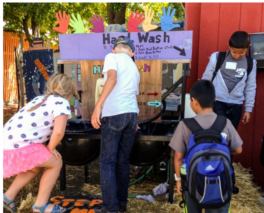
Example of handwashing signage, near a handwashing station.